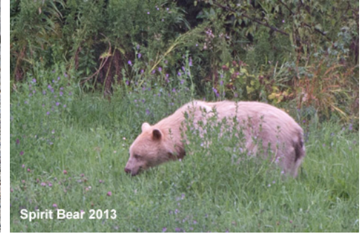
Spirit Bear 2013

This was my first visit to Jasper and I liked it. Although it took some time and lots of pointers and advice from many of