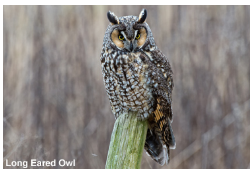
Long Eared Owl

I started the year as I did 2012 and visited the snowy owls over on the British Columbia coast at Boundary Bay. This year I was fortunate not only to encounter snowy owls and northern harriers but I also managed a couple of 'firsts' when I came across several short eared owls and a splendid long eared owl in its prime.