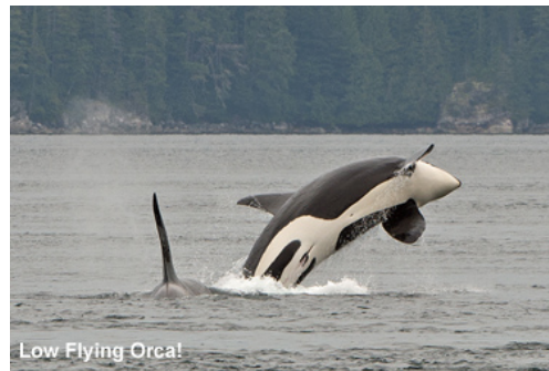
Low Flying Orca!

The very beginning of August saw the first 'super pod' of orca come together in Johnstone Strait and thanks to Discovery Marine Safaris I was there to record the events of the day for them. Without a doubt the highlight of the day was seeing a female orca breach a number of times and on one occasion I was fortunate to catch the whole sequence.