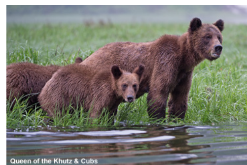
Queen of the Khutz & Cubs

As I had been on my first visit in 2012 and still am every time I visit, my two colleagues were just in awe of the spectacular beauty and superb wildlife of this area. The bear encounters were exceptional and even the rain wasn't too bad! It was good to see old friends both human and bruin including the 'Queen of the Khutz' still with her two cubs.