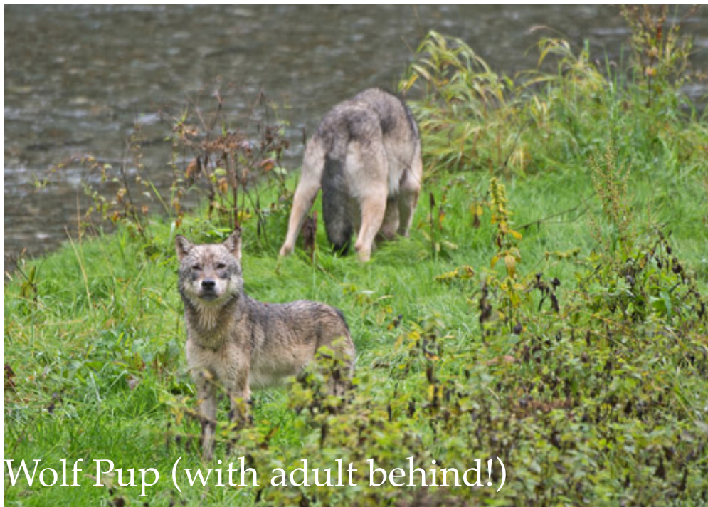
Wolf Pup (with adult behind!)

I stepped off the trail again on his side and put a tree and some bushes between us. He stopped again and started eating the bushes. I avoided the trail and bush whacked my way out to my vehicle.