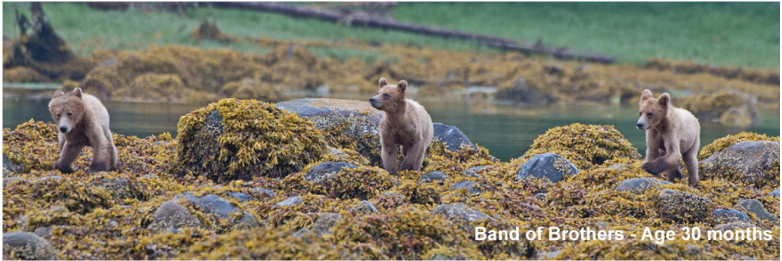
Band of Brothers - Age 30 months

They were all still together and doing well having recently left their mother. It is always special to see the same bears year after year, but three cubs having all made it to this important stage of their lives is very rare.