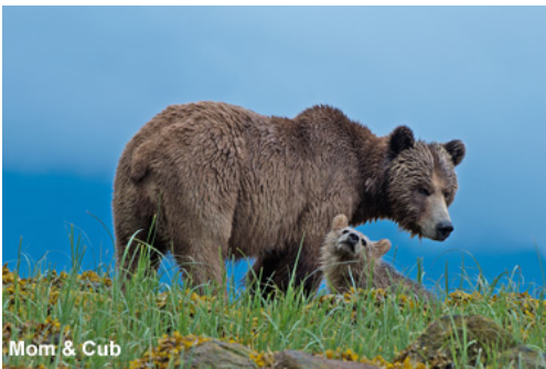
Mom &amp; Cub

Mid-June saw me return to Knight Inlet for a couple of photo-tours I had arranged. Over the years many people have asked how could they join me when I go and photograph the bears. So this gave some the opportunity as well as the chance, for those who wanted it, to pick up a few field tips at the same time. The two tours were a great success and all who attended seemed very pleased with their days encounters.