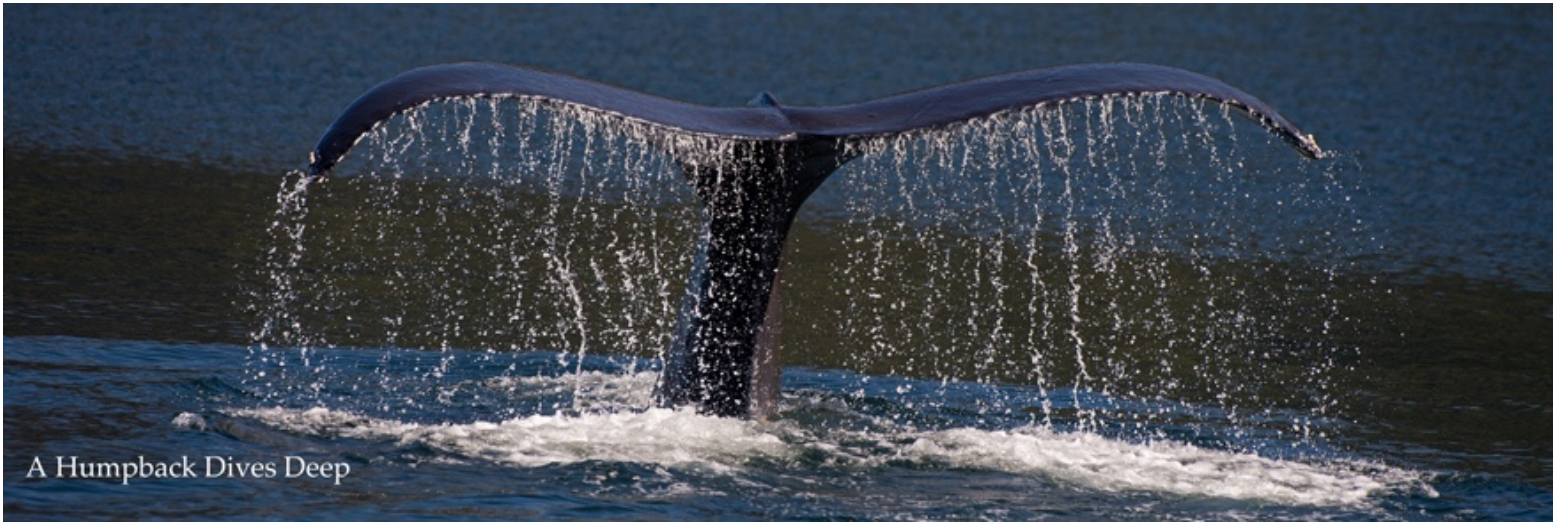
A Humpback Dives Deep

Late February saw a return to one of my favourite photographic spots for humpback whales - Maui. As it turned out, this would not be my only spectacular encounter with humpbacks in 2012, but it was certainly a great start.