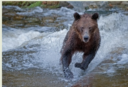
The BC SPCA Wild Settings Winner!

February was a really special month for me as I finally got to see and photograph some snowy owls in the wild. This had been a lifelong ambition as I had always been fascinated by these beautiful birds since childhood; when I came across one in captivity. A few of these owls travel to southwest BC each winter and 2012 saw an exceptional number show up. The shots from the day quickly became firm favourites and I hope to return to the same location over on the mainland early in 2013 to try and get some more.